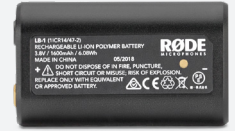
LB-1 Lithium-ion rechargeable battery