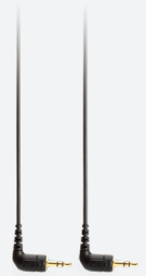
3.5mm TRS Cable